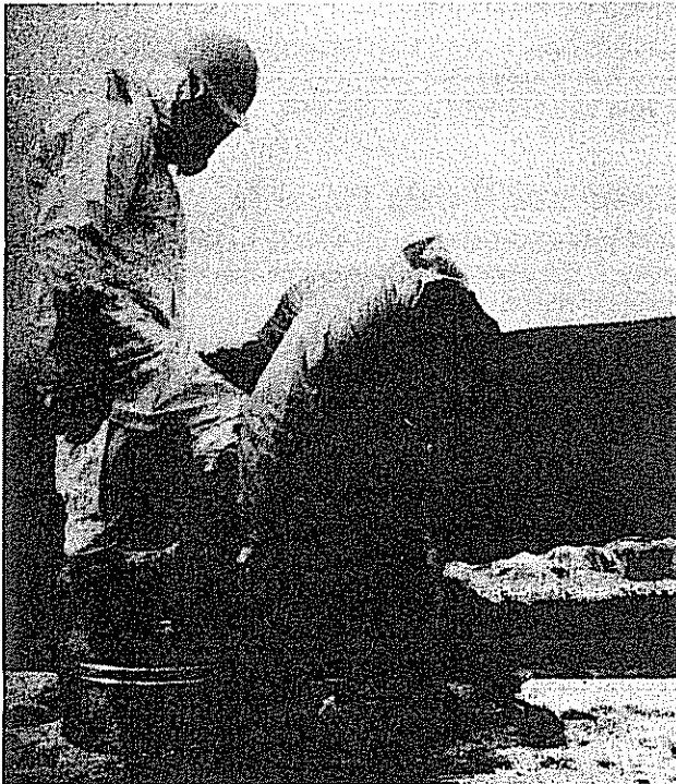
Gross contaminants can be removed with water or a liquid rinse. Here, a member of the decontamination team rinses and scrubs the boots of a worker with a soft-bristled brush. Both individuals are wearing Level C personal protective equipment.